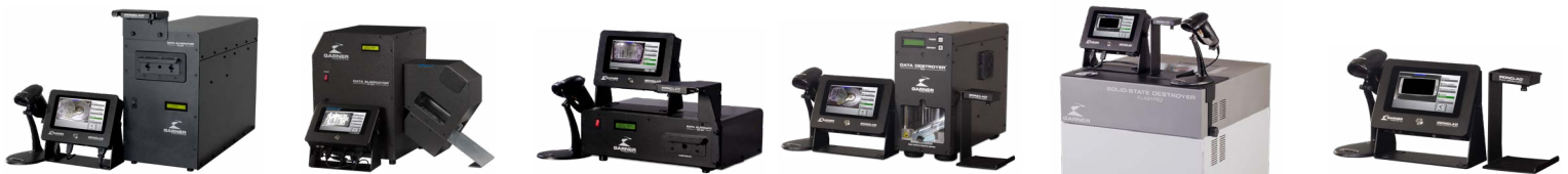
NSA Listed TS-1XT Degausser

Add IRONCLAD to any Garner Degausser and/or destroyer. The IRONCLAD universal model can be integrated into an existing destruction process or function as a stand-alone witness verification.