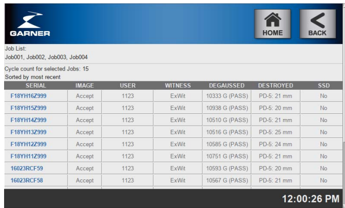
Report view of destruction results