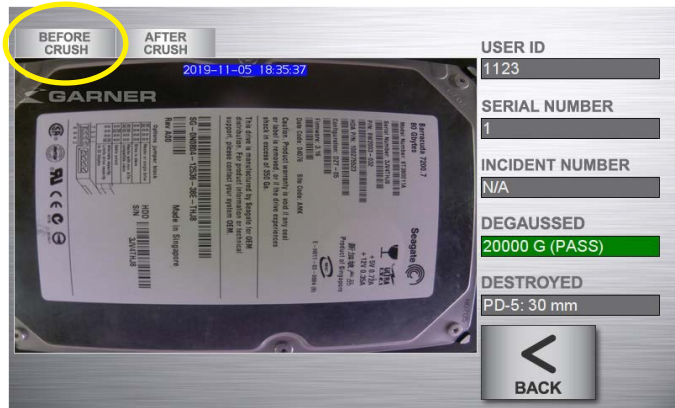
Proof of erasure and destruction