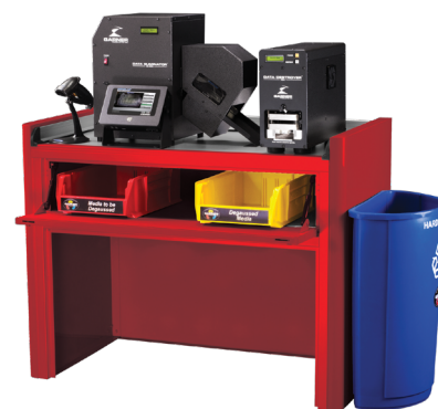
Degauss Destroy Recycle Workstation (DDR-35SSD IRONCLAD shown)