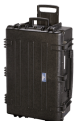
CASE-PD5SSD MIL SPEC Shipping Case