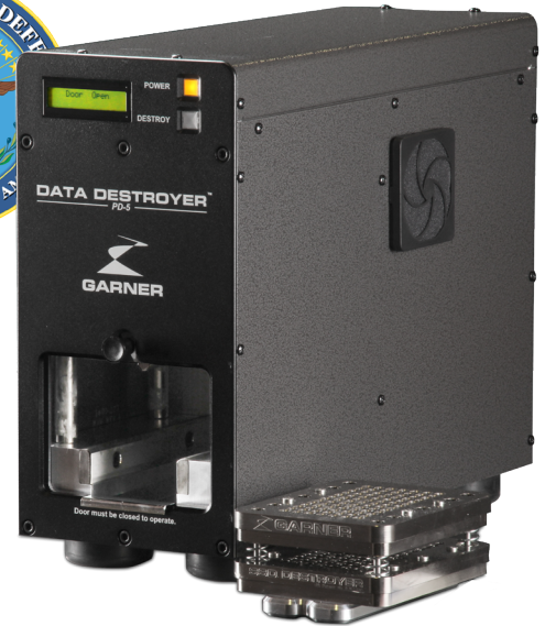
*Shown with optional SSD-1 solid-state destroyer