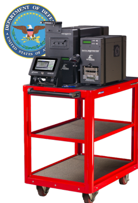
Data Eliminator Cart Package (RCC-1XT5SSD IRONCLAD shown)

The PD-5 operates as a stand alone unit or as part of a complete degauss and destroy system when paired with our TS-1XT NSA-listed degausser, HD-3XTL high-volume degausser, or HD-2XT high-speed degausser. Add a cart, case, or workstation.