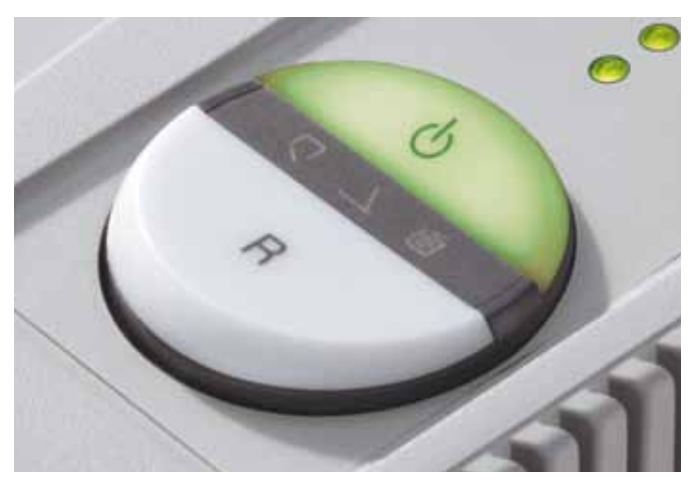
EASY_SWITCH Ease of operation: intelligent multifunction switch element with integrated optical signals indicating the operational status. Additional "emergency switch" function.