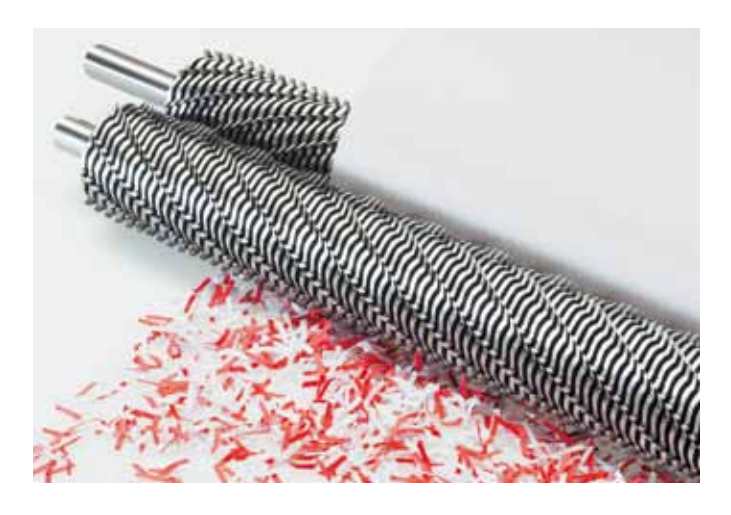
SOLID STEEL CUTTING SHAFTS Robust and durable: high-quality paper clip proof cutting shafts from special hardened steel. 30 years guarantee on the cutting shafts.