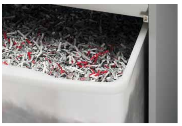
PRACTICAL SHRED BIN The lightweight shred bin made of impactresistant plastic is easy to handle and can be used with or without a plastic bag.