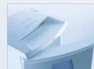
The waste bag can be taken out easily through the large door.