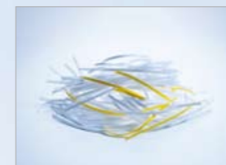
Security level 2 – Strips For internal documents that need to be rendered illegible such as computer lists or bad photocopies. Cutting size: 3.9 mm.