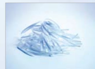
Security level 2 – Strips For internal documents that need to be rendered illegible such as computer lists or bad photocopies. Cutting size: 5.8 mm.

Don Ruffles Limited t. +44(0)845 5555 007