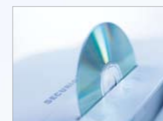
At security level 2, the SECURIO B34 can shred CDs with ease.