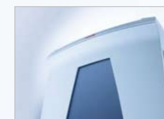
Due to its large collection volume, the SECURIO B34 is suited for use by several persons.