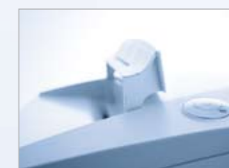
The safety cover can be simply folded up in order to shred large amounts of paper.