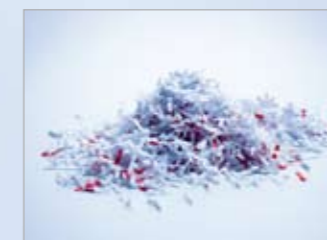
Security level 3 – Particles For confidential documents such as personal data. Cutting size: 4.5 x 30 mm.