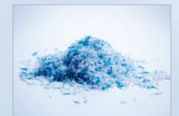
Security level 4 – Particles When the confidentiality of documents is important for a company's existence. Cutting size: 1.9 x 15 mm.