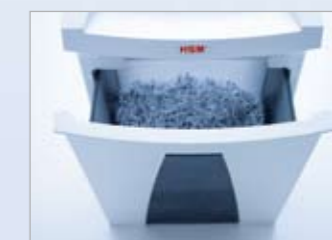
Tilting container for easy removal of the shredded material.