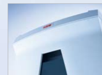
Container handle of elegant design.