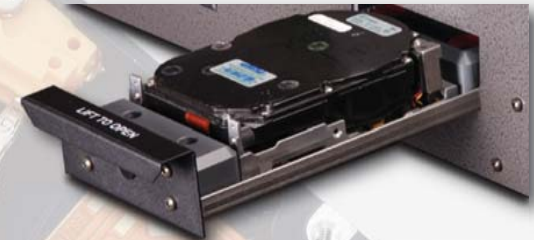
1.5" Hard Drives