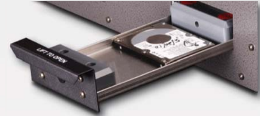
Laptop Hard Drives