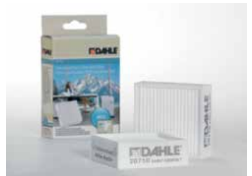
Fine particle filters Dahle 20710