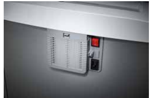
Dahle Top Secret 710air document shredder