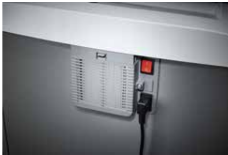
Dahle Top Secret 710air document shredder