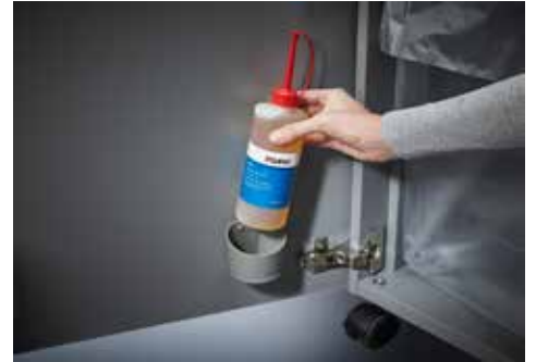
Dahle Top Secret 710air document shredder