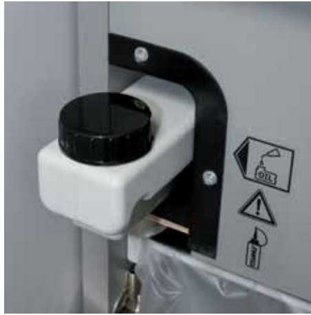
Integrated oil tank for controlled, automatic lubrication of the cross-cut cutters helps to lengthen service life while keeping performance constant