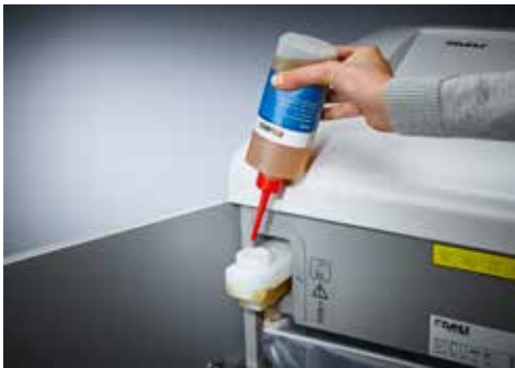
Dahle Top Secret 710air document shredder