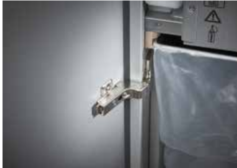
Dahle Top Secret 710air document shredder