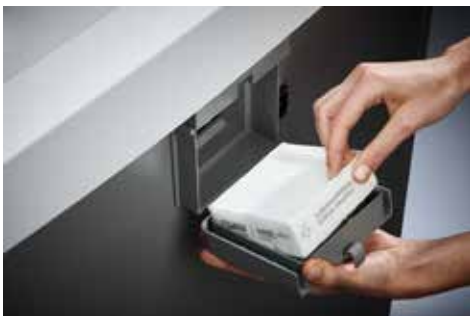
Dahle Top Secret 710air document shredder