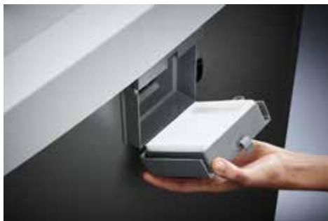
Dahle Top Secret 710air document shredder