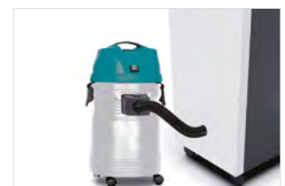
DCS-500 COMPLETE DUST COLLECTION SYSTEM to provide dust free padding mats.