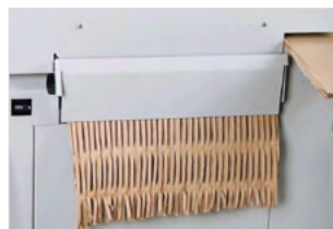
ADJUSTABLE CUSHIONING VOLUME OF HARD CARTON