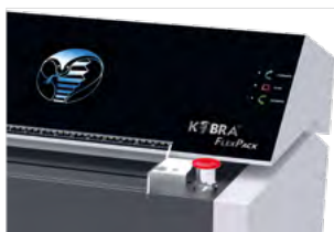
REMARKABLE TOUCH SCREEN PANEL