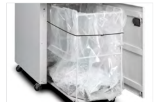
ADJUSTABLE REMOVABLE TROLLEY

It eliminates the need to manually lubricate the unit, ensuring maximum reliability, efficiency and capacity.