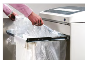
TWO DISTINCT BINS

Two entry openings and two sets of cutting knives for the separate insertion and shredding of paper and CDs/DVDs/credit cards.