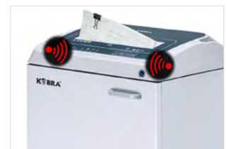
METAL DETECTION SYSTEM SHRED GUARD

The Shred Guard System stops the machine when large metal objects are accidentally inserted. An illuminated optical indicator warns the operator to remove these objects in order to protect the knives.