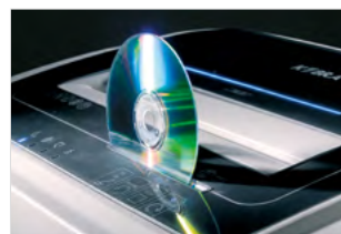
TWO SEPARATE SETS OF CUTTING KNIVES

Shows the shredding load required to optimize shredding without jams.