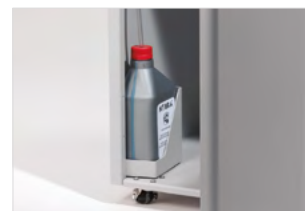
AUTOMATIC OILING SYSTEM

Two entry openings and two sets of cutting knives for the separate insertion and shredding of paper and CDs/DVDs/credit cards. Two integrated and removable bins to separate shredded paper from plastic shreds.