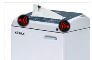
METAL DETECTION SYSTEM SHRED GUARD

The Automatic Oiler eliminates the need to manually lubricate the unit. Not only does this protect the blades with anti-corrosive agents, but ensures maximum reliability, efficiency and capacity.