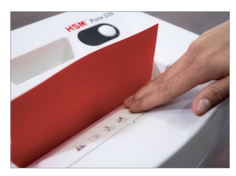
High level of user safety

The paper feed with overload protection reduces paper jams and sustains the high throughput of paper.