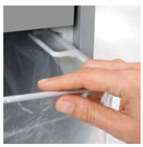
Pull-out rounded top frame that's kind on the fingers when changing the waste bag