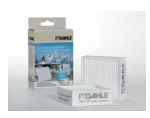
Fine particle filters Dahle 20710