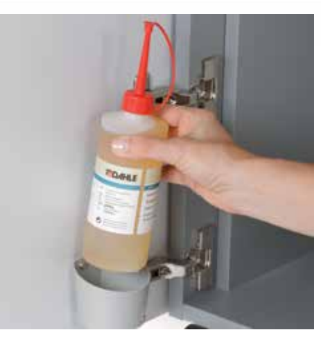
Environmentally friendly oil is always easy to access, included with all cross-cut models