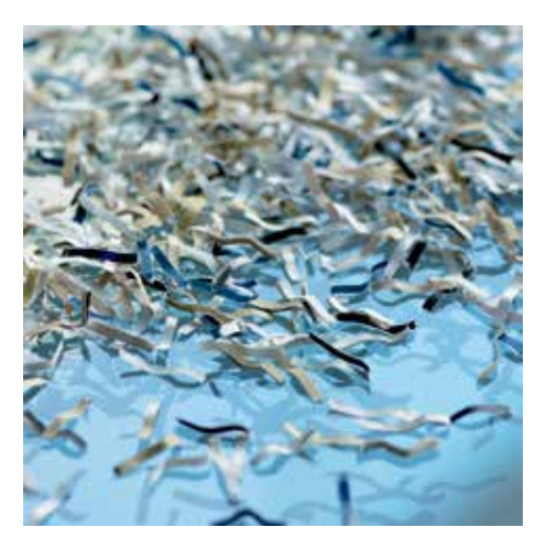
P-5 security: recommended, for example, for data media containing secret data