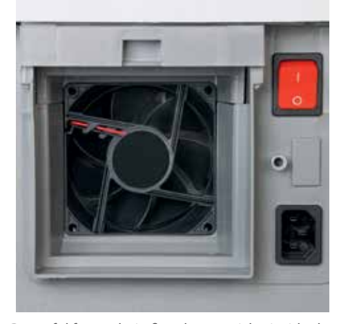
document shredder and feeds them to the filter