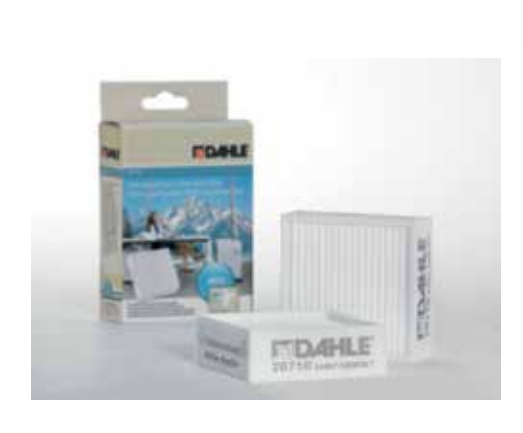
Fine particle filters Dahle 20710