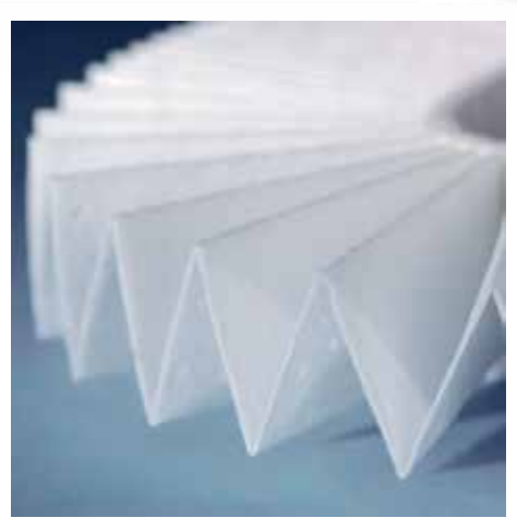
Environmentally friendly filter is made of special 3-ply, fully recyclable non-woven material