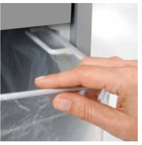
Pull-out rounded top frame that's kind on the fingers when changing the waste bag