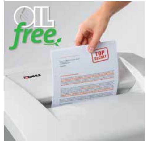
Shredding the convenient way, all without the time-consuming process of oiling the cutters